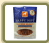
Dogswell Happy Hips