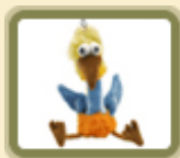
Bird Brain Swan

Check out the latest and greatest from everyone's favorite pet boutique!