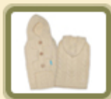
Beigie Hoodie Cable Coat