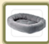
Smoke Donut Bed